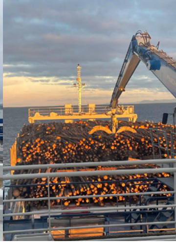
LOADED WITH TIMBER LOGS