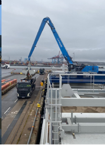
DISCHARGING SAND TO LORRIES